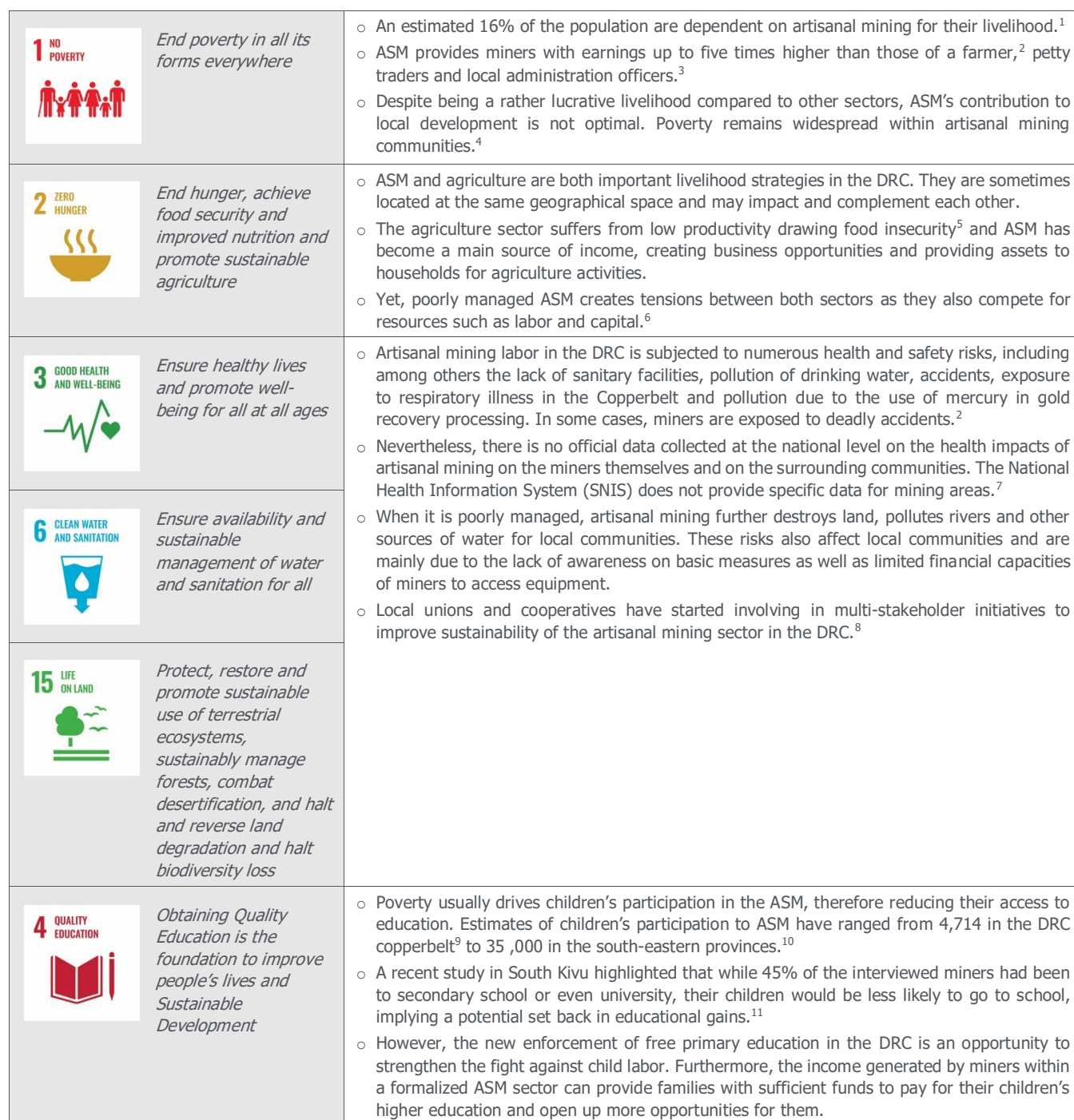
Table 2: ASM linkages to Sustainable Development Goals

The table below shows examples of linkages between ASM and SDGs in the DRC.